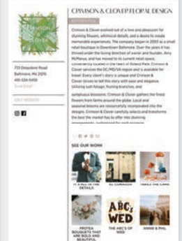
Enhanced Vendor Listing